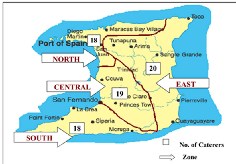
Figure 1: Zonal Boundaries of the SNP